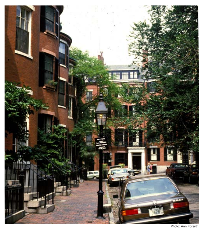
Beacon Bill in Boston is an area where high lot coverage and small setbacks combine to make a high quality environment.

Many of the most charming environments in the world have buildings with small setbacks, high building coverage, and relatively small distances between buildings. More open space is not necessarily better, particularly when such open space is poorly designed.