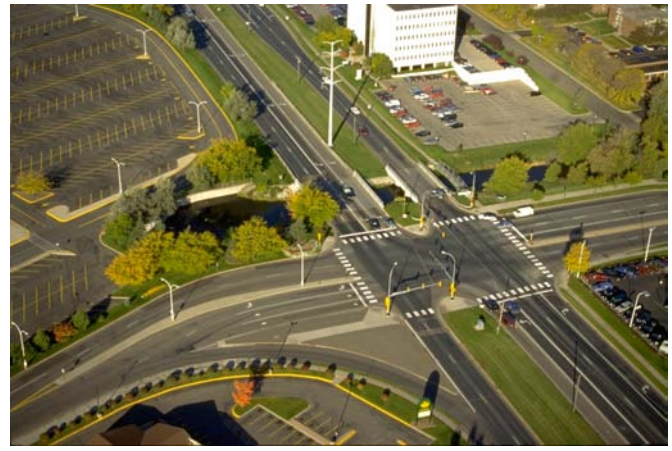
Large setbacks are not always attractive. Large areas devoted to the automobile can also force the neighborhood and city level densities down, even when the residential<sub>hot: DCAUL</sub> areas have many dwellings on a small amount of land.

One area of confusion is between density and other related terms. On one side are physical measures of the intensity of use of land including measures of building bulk and coverage. A number of such measures are listed in Part B of the working definitions section. These measures say something about how big the buildings are, although they are only rough measures.